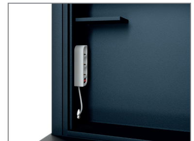
Media cabinet with plug bar and shelf